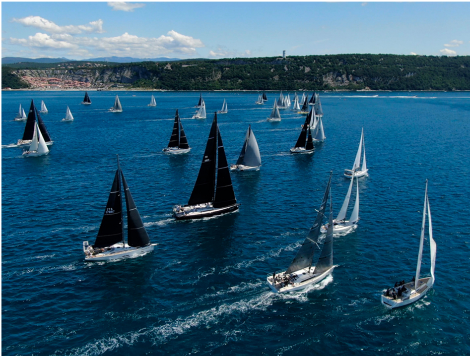
The Grand Soleil Cup sailing will take place between the beautiful waters of Porto Cervo and the Maddalena Archipelago.

Cantiere del Pardo is bringing back the Grand Soleil Cup, which is scheduled to take place from June 21 to June 23 off the coast of Costa Smeralda, Sardinia, in the Western Mediterranean.