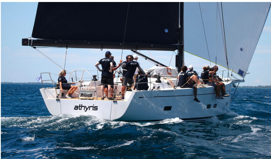
All Grand Soleil owners are invited to participate with their family and friends.

Festivities will begin on Thursday with a welcome for participants at the Yacht Club Costa Smeralda. Friday will be dedicated to registrations, followed by the crew briefing and cocktails on the terrace. Saturday and Sunday will be all about sailing, with a gala dinner on Saturday night.